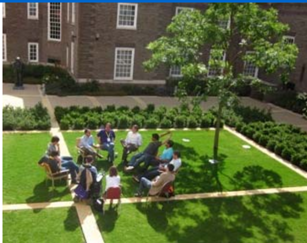
Basic Consulting Readiness